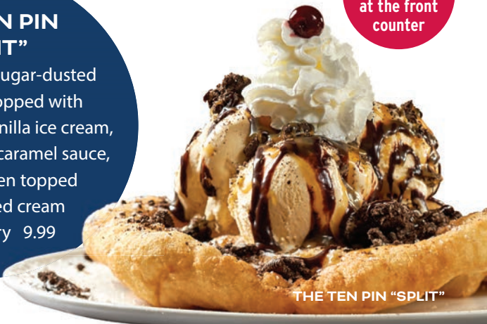
THE TEN PIN "SPLIT"

THE TEN PIN "SPLIT" Cinnamon and sugar-dusted fried dough, topped with three scoops of vanilla ice cream, hot fudge, salted caramel sauce, and Oreos, then topped with whipped cream and a cherry 9.99