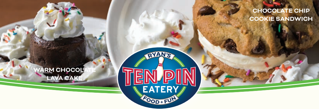
CHOCOLATE CHIP COOKIE SANDWICH