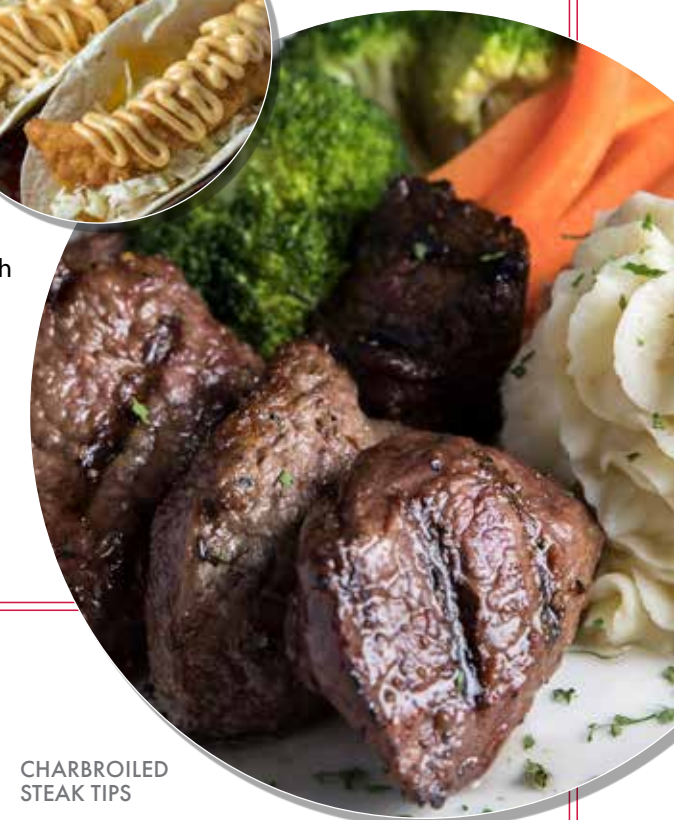
CHARBROILED STEAK TIPS