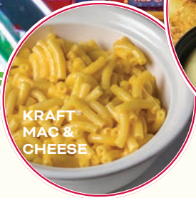
KRAFT® MAC & CHEESE