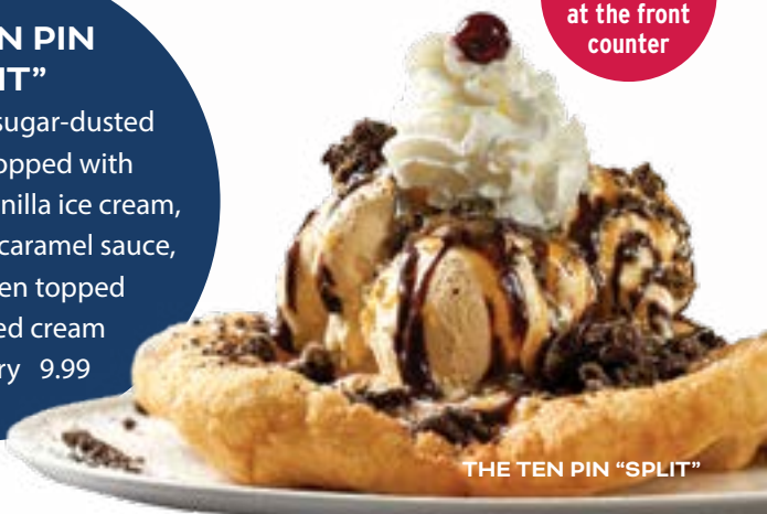
THE TEN PIN "SPLIT"

Please place your order at the front counter