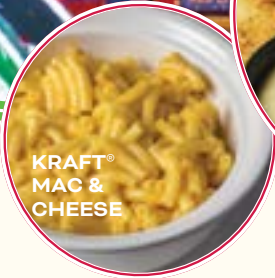
KRAFT® MAC & CHEESE