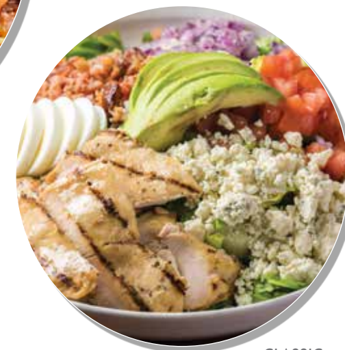
CLASSIC COBB SALAD

A blend of Parmesan and Mozzarella cheeses, creamy spinach, and chopped artichoke hearts on a toasted flatbread 11.99