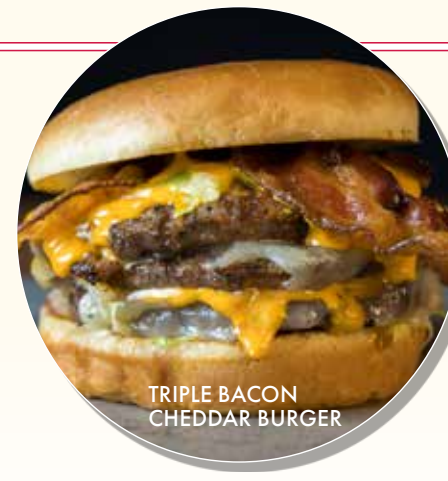
TRIPLE BACON CHEDDAR BURGER