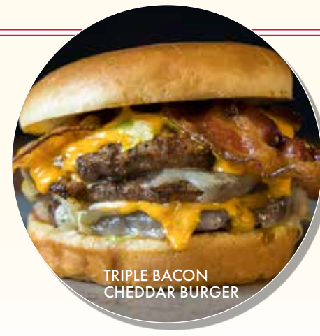
TRIPLE BACON CHEDDAR BURGER