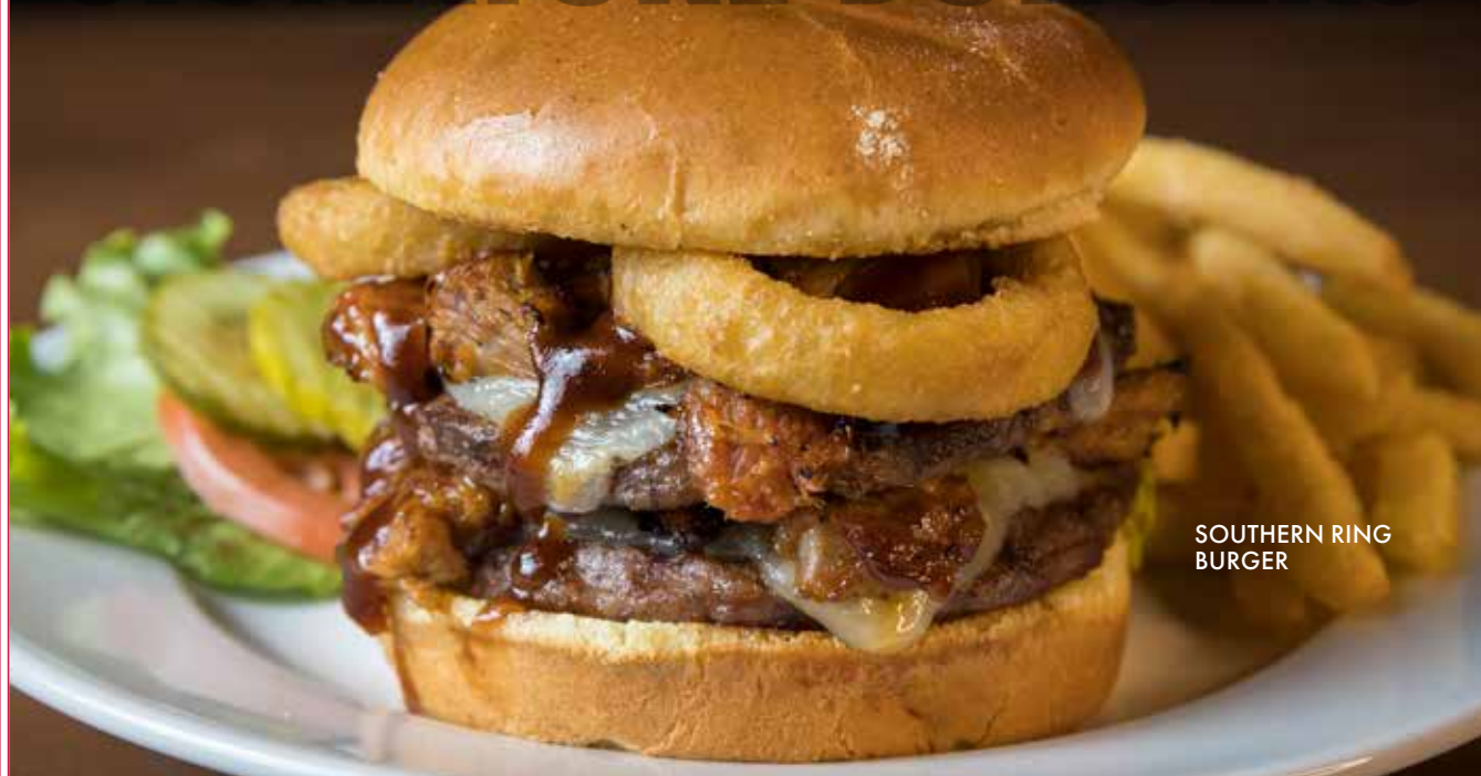
SOUTHERN RING BURGER