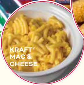
KRAFT® MAC & CHEESE