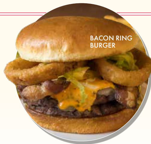
BACON RING BURGER