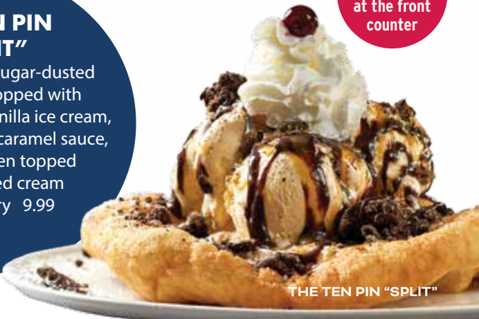
THE TEN PIN "SPLIT"

Please place your order at the front counter