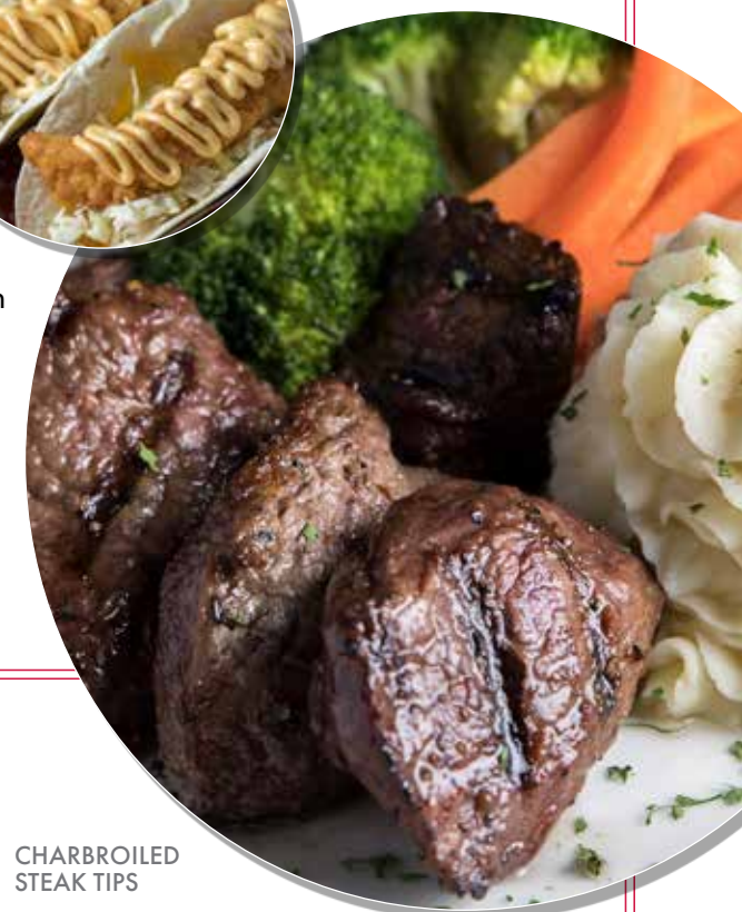
CHARBROILED STEAK TIPS