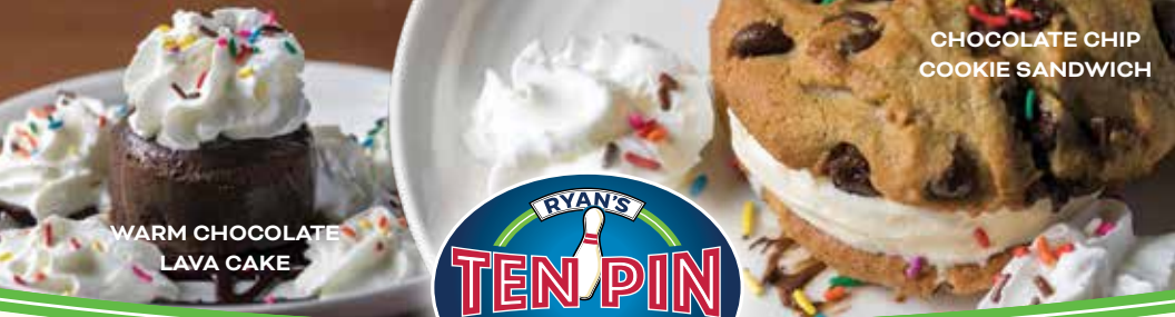
CHOCOLATE CHIP COOKIE SANDWICH