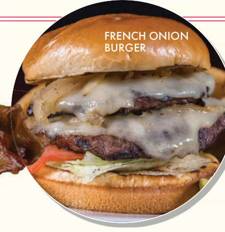
FRENCH ONION BURGER