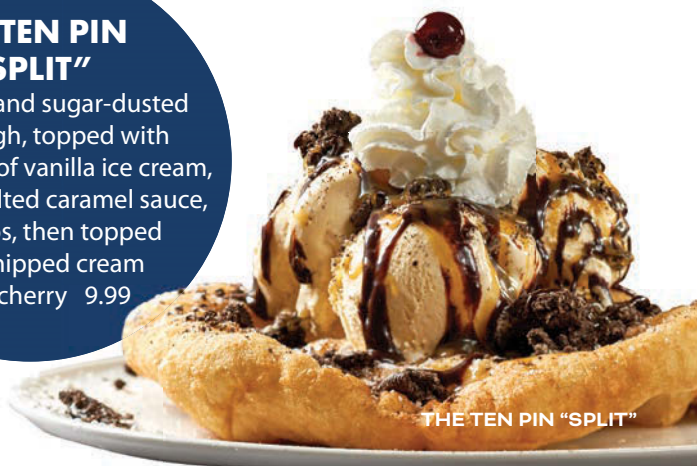
THE TEN PIN "SPLIT"

Cinnamon and sugar-dusted fried dough, topped with three scoops of vanilla ice cream, hot fudge, salted caramel sauce, and Oreos, then topped with whipped cream and a cherry 9.99