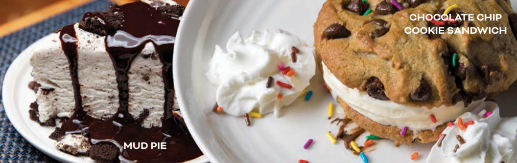
CHOCOLATE CHIP COOKIE SANDWICH