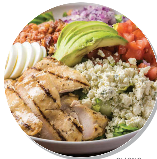
CLASSIC COBB SALAD