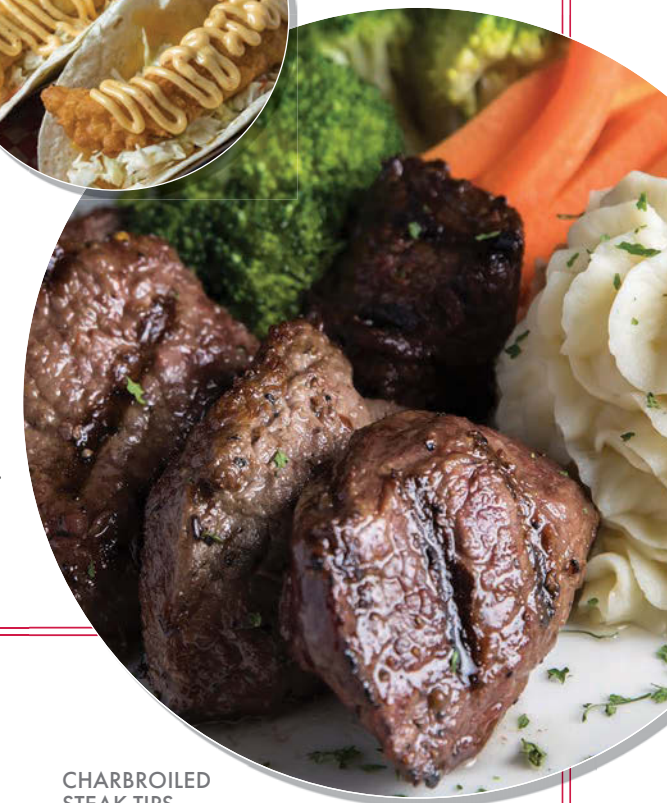
CHARBROILED STEAK TIPS