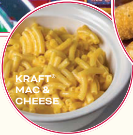
KRAFT® MAC & CHEESE