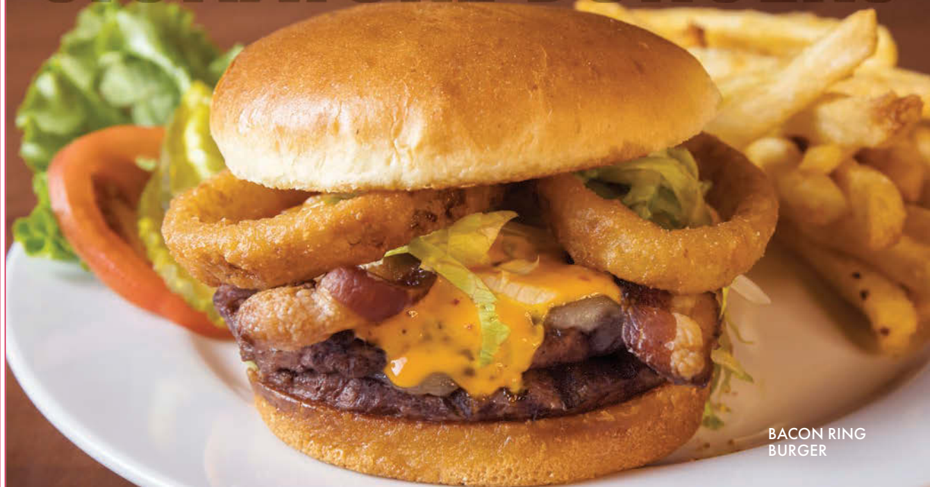
BACON RING BURGER