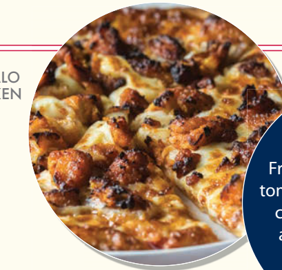
BUFFALO CHICKEN PIZZA