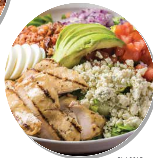
CLASSIC COBB SALAD

Boneless Buffalo Wings 6.99 Grilled Chicken 6.99 Three Angus Steak Tips 8.99