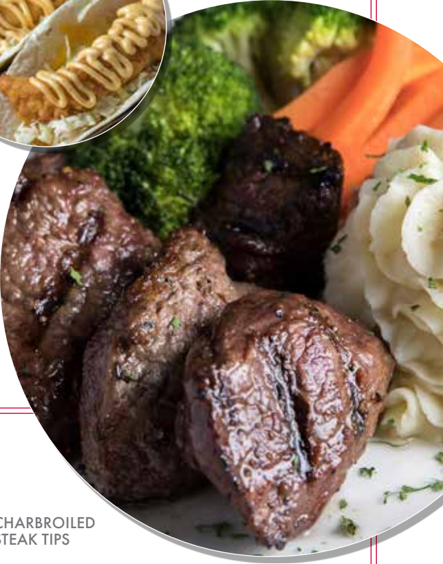
CHARBROILED STEAK TIPS