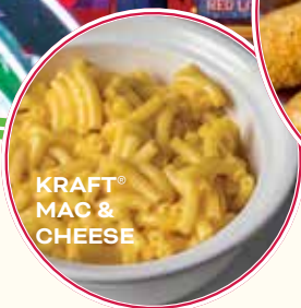
KRAFT® MAC & CHEESE