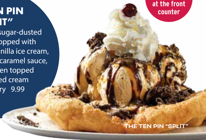
THE TEN PIN "SPLIT"

Please place your order at the front counter